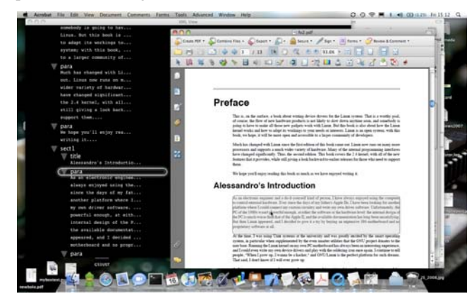
Figure 6.1 – XML PDF Workflow Visualization

The first visualization tool developed mimics the one developed by Hardy [10]. Here, the original XML source document is showed in tree form alongside, the PDF document. Figure 6.1 shows our implementation. The UI enables the user to see part of the PDF document with its source XML node highlighted, and vice versa, i.e. highlighting part of the XML tree and seeing which part of the PDF it generated.