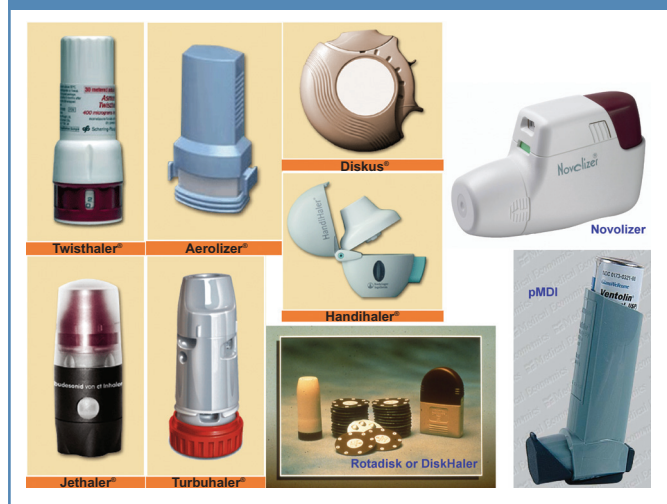
Figure 3. Some of the available hand-held inhaler devices.

various DPIs will therefore affect pulmonary deposition. 41 Many different types of DPIs have been developed, some of which are shown in Figure 3. They can be subdivided according to the number of doses they contain, whether they contain preloaded doses or require loading, and whether they are reusable (Figure 2). Some of these DPIs provide the patient with several feedback mechanisms and are able to assure the patient that the dose has been delivered correctly. For example, the single-dose Aerolizer ® provides visual, auditory and taste feedback, features also present in the multi-dose Novolizer ® . In addition, the Novolizer ® contains an inspiratory flow triggering mechanism.