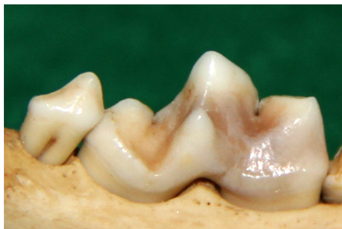
Fig. 3. Same individual Greater Grison G. vittata as in Fig. 2. Ventral view of cranium showing fully erupted teeth, fused sphenopalatine suture (upper); Lingual view of left mandible, showing m1 and m2, with m1 metaconid diagnostic for G. vittata (lower; see Bornholdt et al. 2013, Fig. 1).