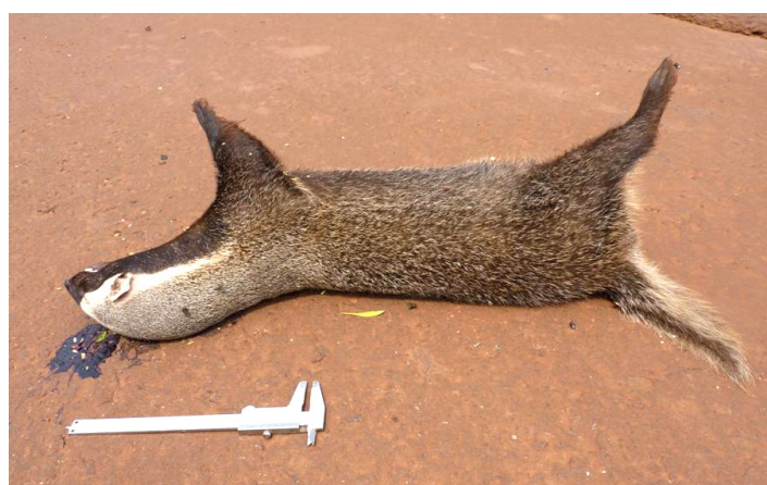
Fig. 2. Greater Grison Galictis vittata encountered dead on 17 September 2010, in Departamento Alto Paraná, Paraguay (Museo Itaipú Binacional catalogue number CBMI 284). Ventrrolateral view (upper); dorsolateral view (lower).