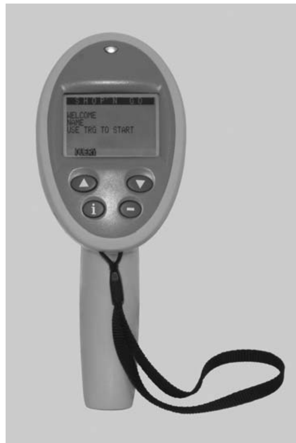
Fig. 1 Hand-held barcode scanner (Shop 'N Go system)

A 12-week single-blind RCT was conducted at a supermarket store in Wellington, New Zealand, between April