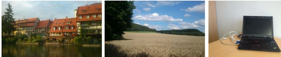
Fig. 7: Photos we could recover from DRAM via cold boot attacks. The right most picture was taken with the Galaxy Nexus instantly before the attack. The other pictures were taken weeks before the attack with another smartphone, but they got synchronized with our target phone via Dropbox.

the disk. We are after personal and corporate data such as contact lists, messaging, photos, and calendar entries.