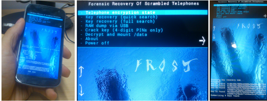
Fig. 4: Graphical user interface of the recovery image. F.l.t.r: recovered PIN from bruteforce, UI menu, and key recovery with the FROST LKM.

All in all, users can choose between one of the following options in the FROST recovery image: