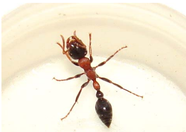
Fig. 3. Arboreal bicoloured ant Tetraponera rufonigra Jerdon

Camponotus compressus and the dimorphic Pheidole spp. nested around the roots of large trees, e.g. Tamarindus indicus . Camponotus compressus was also found on Acacia nilotica and Moringa oleifera growing on field margins. They were tending homopterans, e.g. leafhoppers Oxyrachis tarandus and aphids for honeydew. Tetraponera rufonigra foraged and nested on trunks of trees like Caesalpinia crista , while Monomorium spp. and Solenopsis spp. foraged inside the fields and nested at field margins. Some ant species (e.g. Tetraponera rufonigra , Polyrhachis lacteipennis , Leptogenys sp, and Crematogaster soror ) were observed foraging solitarily on large trees like Caesalpinia crista