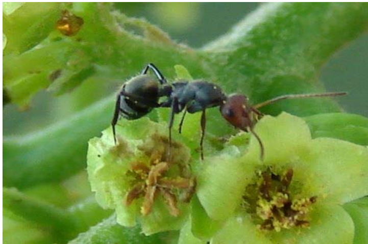
Fig. 4. Solitary foraging is seen in Camponotus sericeus Mayr

Up to now most species are not identified, so it is not possible to assess the prevalence or impact of invasive species, but we expect our list will include many tramp species originating from other places of the tropics (Holway et al. 2002). In this case the originally species-rich Indian ant fauna would appear to have been even further depleted.