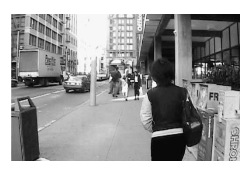
Figure 4. Scene rated high on enclosure, linkage, and complexity (San Francisco, CA).