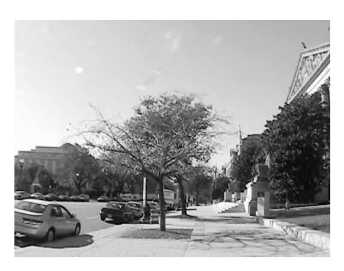
Figure 3. Scene rated high on imageability, legibility and coherence (Washington, DC).