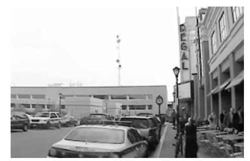
Figure 5. Scene rated low on all eight urban design qualities (Rockville, MD).