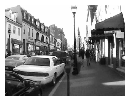
Figure 2. Scene rated high on all eight urban design qualities (Annapolis, MD).

Figures 2–5 are static images from four of the video clips, illustrating variation in urban design qualities. Clips were rated by the expert panel on a scale that represented low to high levels of each quality (1 to 5).