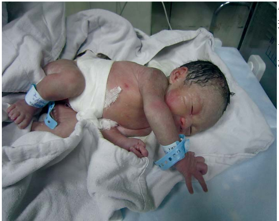
Fig. 4. Erythema spread all over the patient's legs.