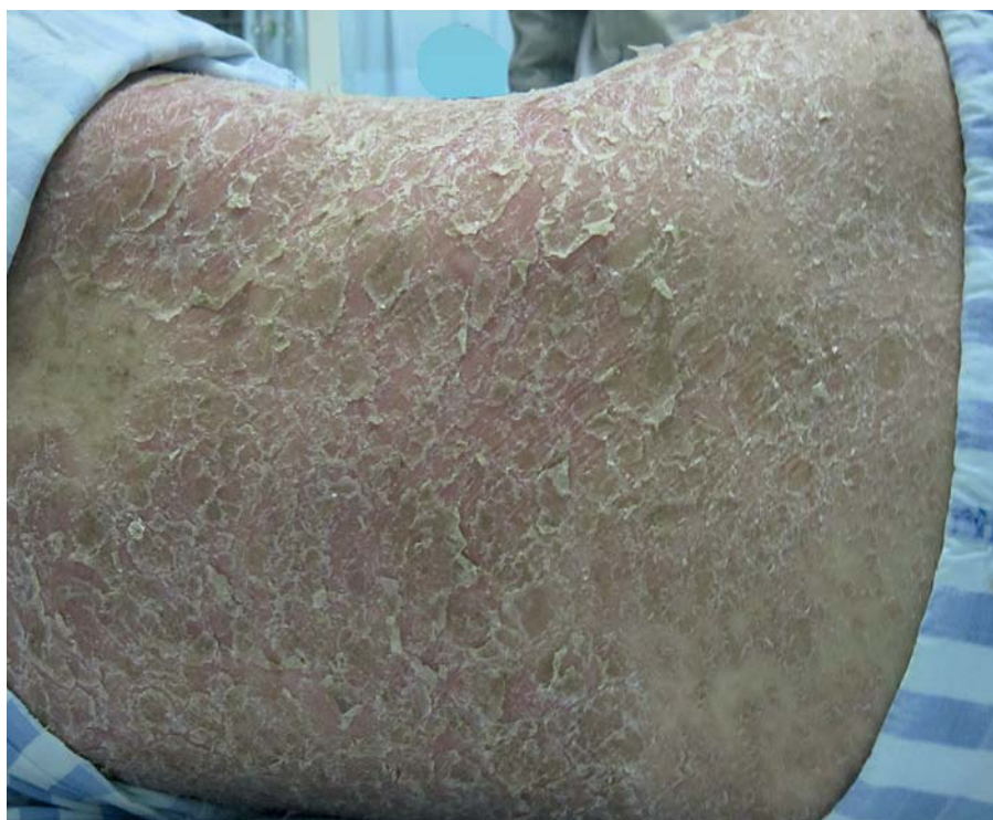
Fig. 6. Exfoliation of the patient's back (2 weeks postpartum).

There are considerable debates on the classification of IH [2, 11, 12, 17, 18]. Some authorities consider the disease as an acute pustular phase of psoriasis, and it may also be a rare form of generalized pustular psoriasis (GPP) in pregnancy. Other observers have defined IH as a distinct entity. Baker and Ryan [19] have reviewed 104 cases of GPP. This disease, which predominantly comes on in the second half of life, affects both sexes and can be provoked by the withdrawal of systemic corticosteroid therapy, pregnancy and infection. Compared with IH, GPP is a rare and yet potentially lethal clinical variant of psoriasis, which is characterized by the formation of sterile cutaneous pustules, neutrophilia, fever and features of systemic inflammation [20]. Only by clarifying the pathogenesis of IH can we distinguish IH from psoriasis.