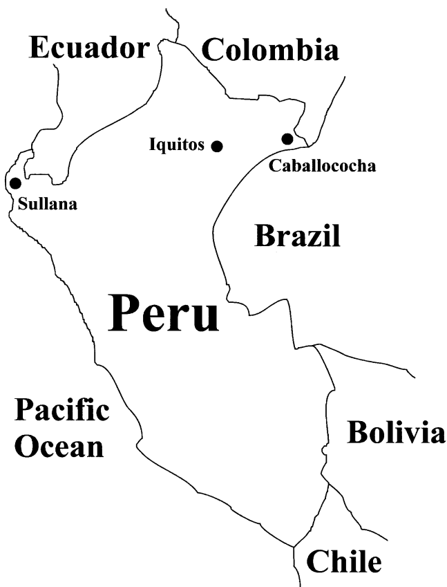
FIGURE 1. Sites of Plasmodium vivax in vivo drug efficacy trials in Peru, 1998–2001.

were dropped from the study. Patients with axillary temperatures \geq 37.5^{\circ}\text{C} were treated with paracetamol.