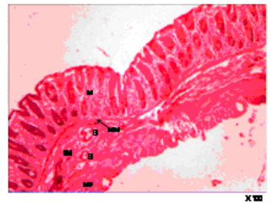
Plate 3: Micrograph of rat stomach showing a protected epithelium due to CSE (750 mg/kg) in ethanol-induced gastric ulceration

Plate 2: Micrograph of rat stomach fairly protected with omeprazole (20 mg/kg) in ethanol-induced ulceration