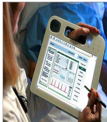
Fig. 1. L-R: A typical Nigerian paper-based health records system, manual filing in developed nation and a glimpse into an electronic health records system aided by ICT.