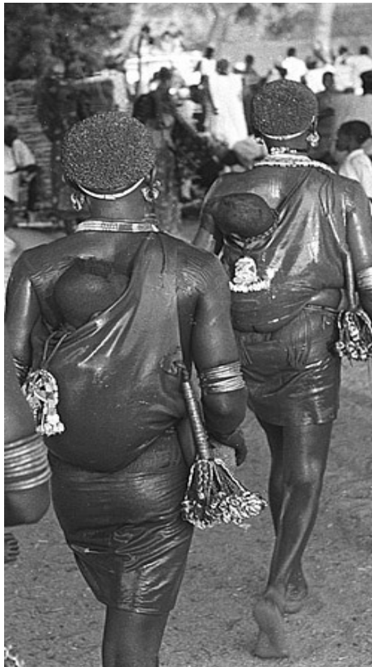
A picture showing the ornamental dress of women on the way to the yearly festival.

immediately after the corn-thrashing season. The Ptil and his advisers set the date, and announce it about a month ahead of time to give the women enough time to prepare for the celebration. I recall the local women waiting in expectation for the Ptil and his advisers to announce the Angarawai date. The moment it is announced, Margi women begin the preparation of the decorative ornament they will be wearing on that date, so that they will look their best for the celebration. I recall my mother working on these ornaments for days.