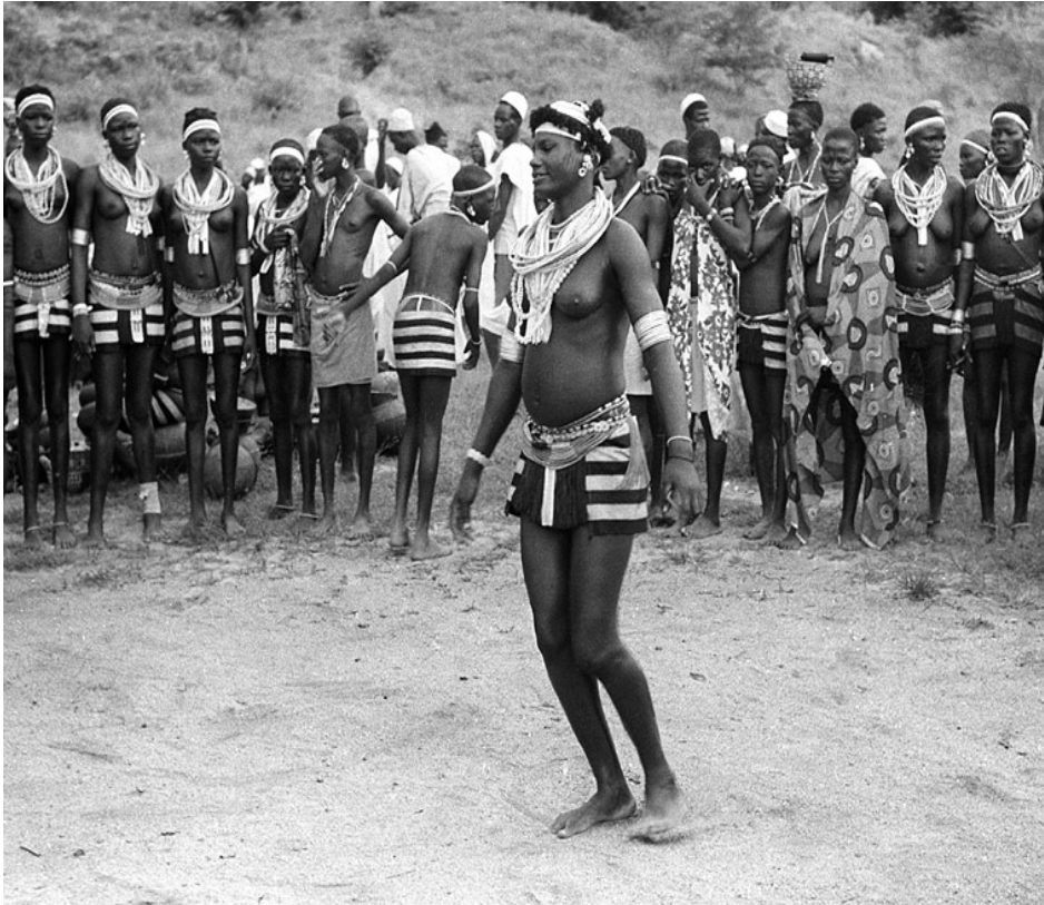
A picture of how Margi girls dress for the Yearly Festivals.