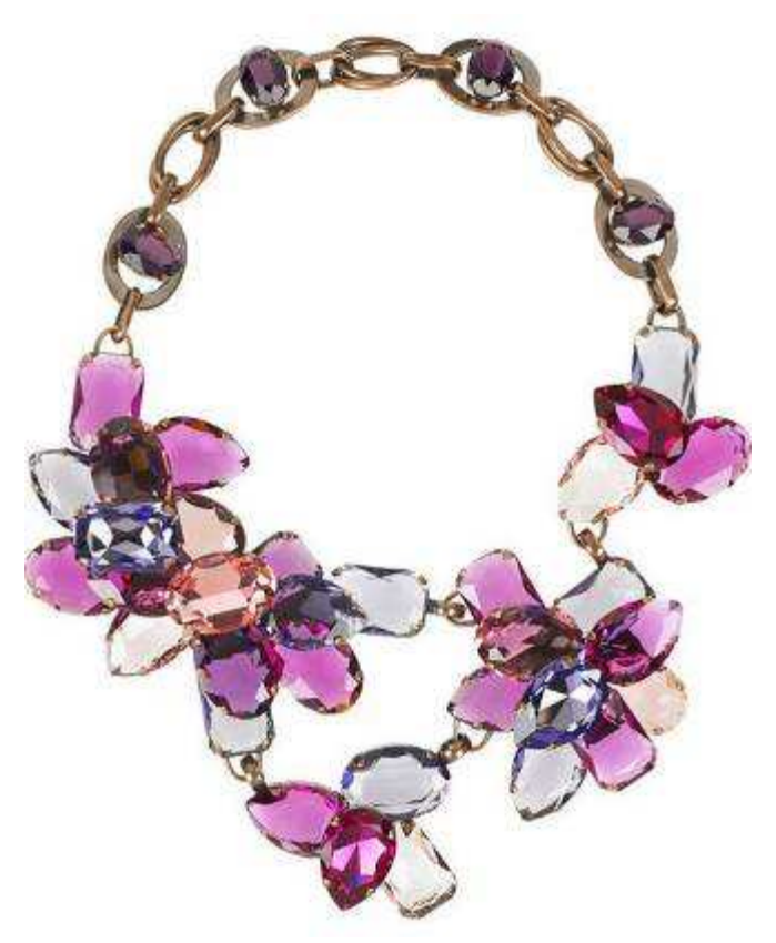
Figure 2 Mix-matching in similar colors