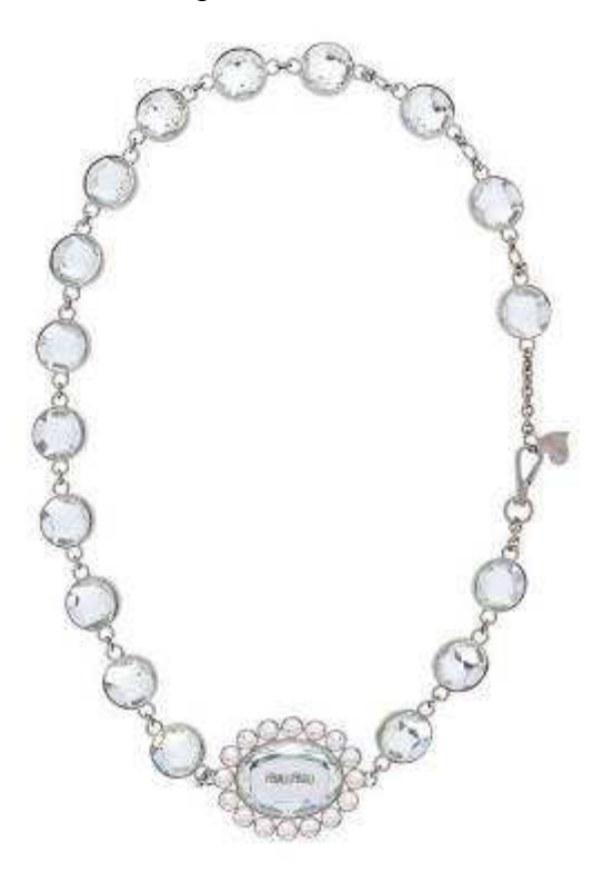
Figure 1 Silver mix-match with crystal

Let's take another example of the mix-match of colorful gems, agate has a light intensity of colors, which gives an strong impact to vision. If you use it as a supplement in a piece of ornament, that might make a distraction. So it's better that we make it as a prime material, mix-matching with black rope or leather rope would be a nice pick.