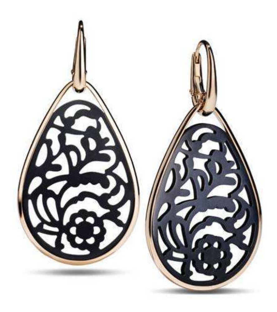
Figure 9 Hollow out wood encased by mosaic gold

In short, in the process of material mashup, taking into account the feasibility of processing, on the contrary, the feasibility of processing also contributed to the possibility of a variety of materials mashup.