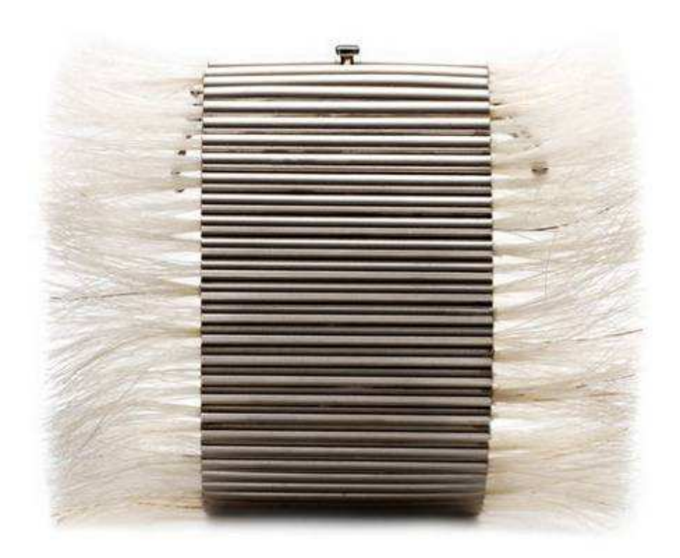
Figure 6 Metal & Fur: metal shows western culture and fur shows eastern cultrue

Of course, we can not only just mix and match the culture in space, we can also mix them in time. we can mix and match the elements on behalf of Chinese culture in different dynasties. We can also mix and match the rococo pattern with modern minimalist lines .they are good matches. (Figure 7)