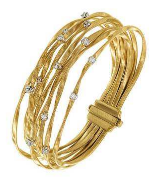
Figure 4 Dots in certain lines

In a conclusion, when doing mix-match on jewelry design, we should follow the principle of dot, line, surface and space. This is the morphology design of jewelry. Only if we find the laws of dot, line, surface and space, only if we find the suitable place for materials, can we do the right and resultful mix-match, can we make our design vivid and interesting, or that will be in a mess. (Picture 4 & 5)