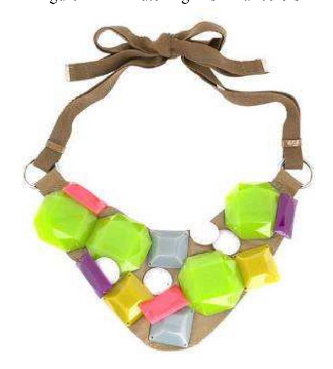
Figure 3 Mix-matching in similar colors

All in all, the mix-match of jewelry should be done under the principles of colors. As a essential part of the whole body's dress, the mix-matching of jewelry design has it's own patterns and specialities.