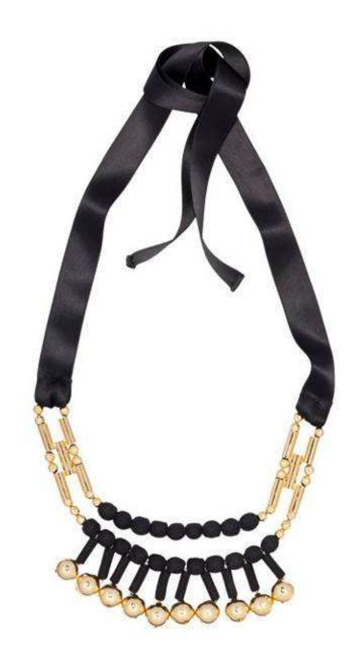
Figure 7 Black Silk is on behalf of Chinese culture but dots are on behalf of western culture