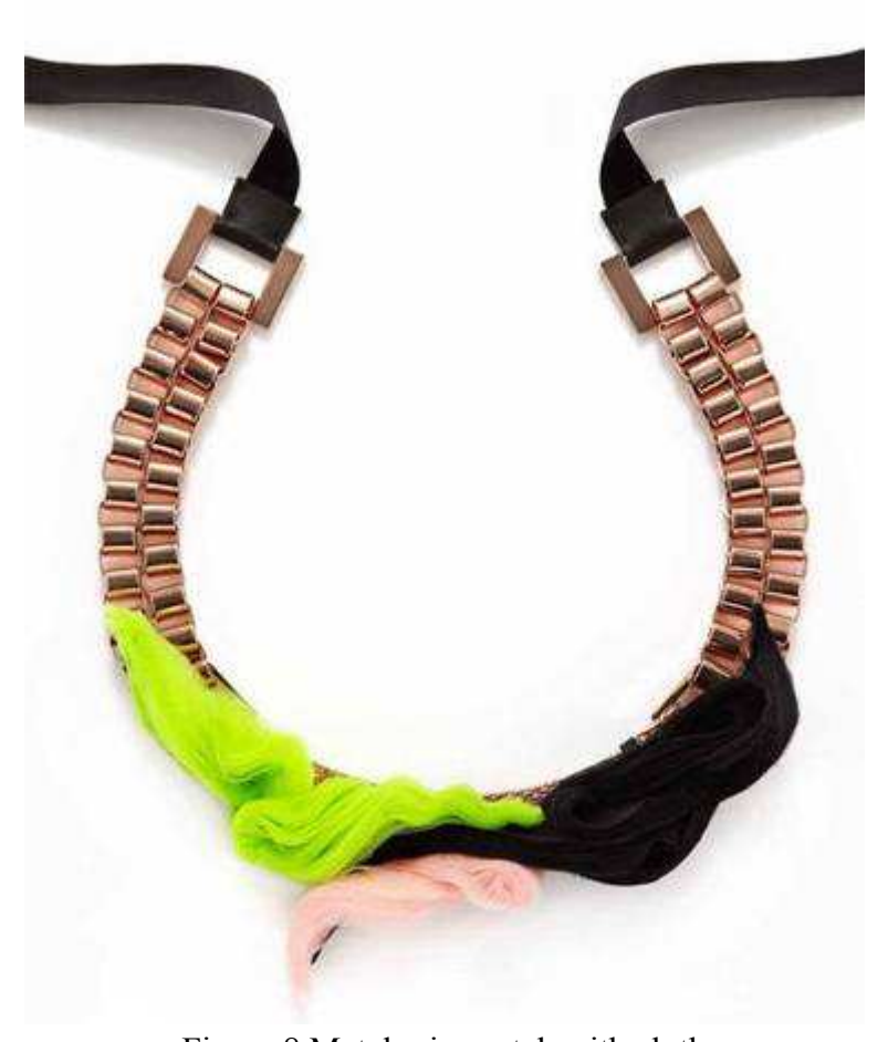
Figure 8 Metal mix-match with cloth

artificial leather artificial texture). Based on various characteristics of the material, we can choose different texture material to mix and match. (Figure 9)