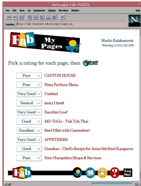
Figure 3: An example set of recommendations, as they appear to a Fab user. In this case the user has already rated all of the pages, and is about to submit the scores.

of the Web, trying to find pages best matching their profiles. Their assumption is that a page will have links to similar pages, and so by following links from page to page they can uncover information pertinent to a particular topic. Index agents construct queries to pass to various commercial Web search engines which have already performed exhaustive indexing. For comparative purposes we have also included agents which supply randomly picked pages, agents which collect various human-picked “cool sites of the day” and agents which attempt to serve an average user (with an average of all the user profiles in the system), rather than maintaining their own specialized profile.