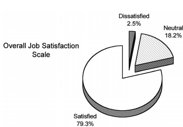
Fig 1. Distribution of overall job satisfaction (scale of 1 to 5). Respondents (n = 319) were categorized as dissatisfied (1.0 to 2.5), neutral (>2.5 but <3.5), or satisfied (3.5 to 5.0).