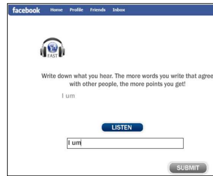
Figure 2 - Example of a Facebook transcription game [14]

The majority of the 37 indexed studies were on speech labeling and transcription (59%), with speech acquisition being