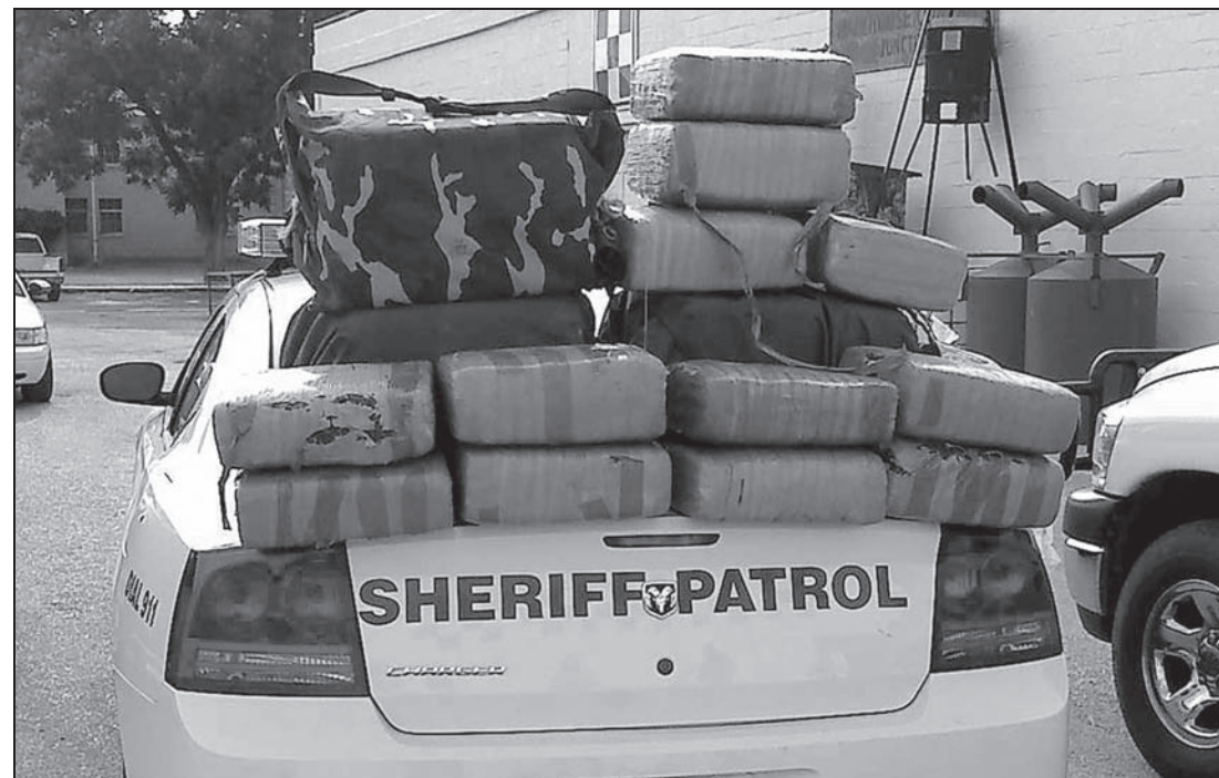
Approximately 360 lbs. of marijuana were seized on Thursday, June 10, when two Mexican nationals were involved in a one vehicle roll over. The two occupants of a 1996 Ford Explorer were airlifted from the accident scene approximately 13 miles east of Junction.