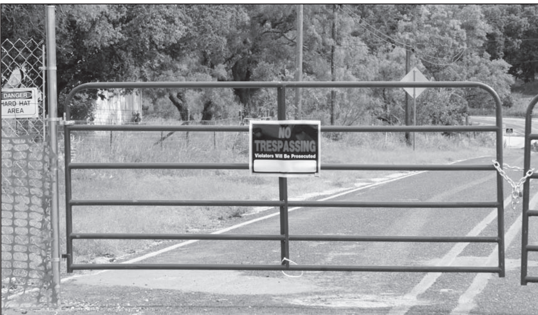
This means you! TXDOT officials in Junction say they are experiencing problems with locals jumping the construction barrier fences recently installed at Flatrock Crossing. Due to the construction in that area, jumping these barriers is dangerous, as well as being unlawful, and subject to possible legal action and/or fines. Citizens should be mindful that this is a "no trespass" zone. Anyone observing these behaviors should call local law enforcement to report violations.