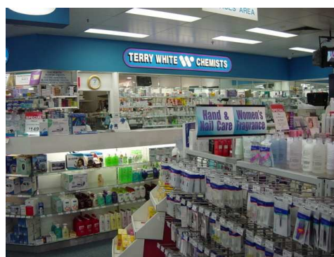
Figure 2. A typical banner-group pharmacy's dispensing area

The around 5000 pharmacies in Australia are mostly supplied by three national wholesalers, the so-called full-line wholesalers. The full-line wholesalers supply prescription drugs -- about 4000 -- and other non-prescription healthcare products, so-called over-the-counter (OTC) products. About 10% of supplies are provided by regional wholesalers who focus on a specific segment of the total product range, the so-called short-liners. Beginning in the 1990s, manufacturers of generic medicines -- that is prescription drugs whose patent protection has expired -- also ship directly to pharmacies.