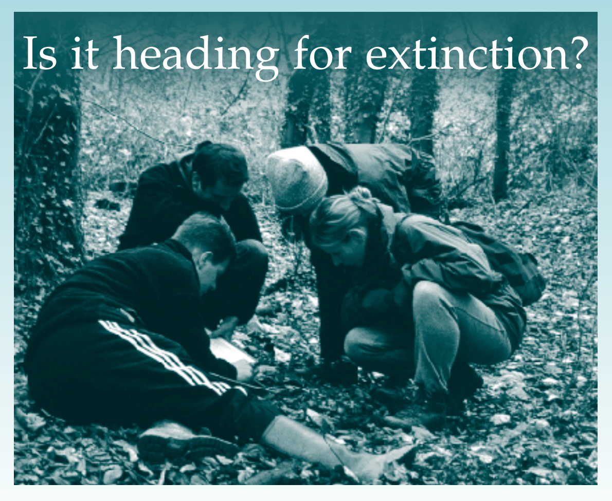
A report on biology fieldwork in the 14-19 curriculum