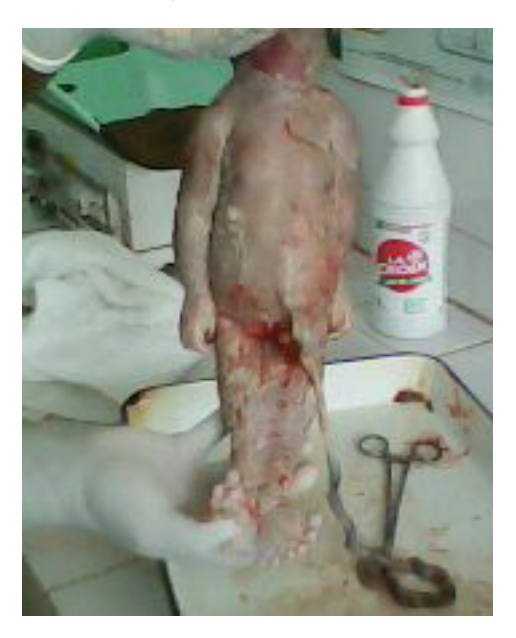
Figure 1. Complete morphological view showing distended abdomen, fused lower limbs and maceration around the neck.