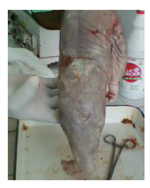
Figure 3. Posterior view showing fused lower limbs, imperforate anus.