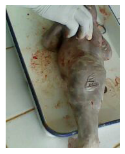
Figure 4. Imperforate anus.