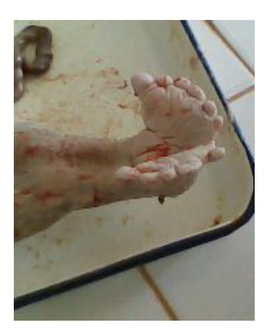
Figure 6. Photograph showing the fused feet with 11 toes.

fused lower segment of the body below the pelvis into a single lower limb, with two feet fused posteriorly giving a single flipper-like foot with eleven toes spread out in a fan-like pattern (Mermaid-like or 'mammy-water'). The foot was oriented anteriorly relative to the trunk, and external palpation gave the impression of probably two femurs and two tibias.