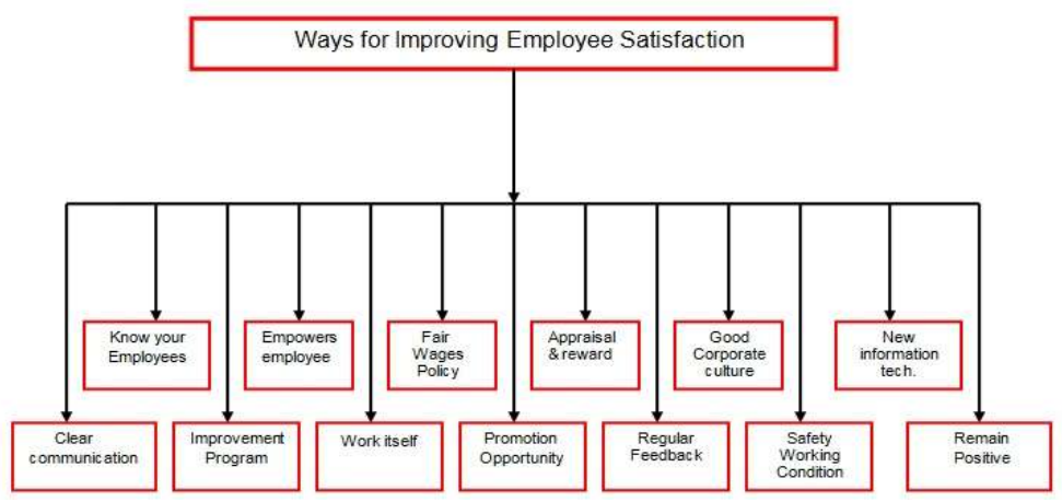
Fig. Ways of Improving Employee Satisfaction