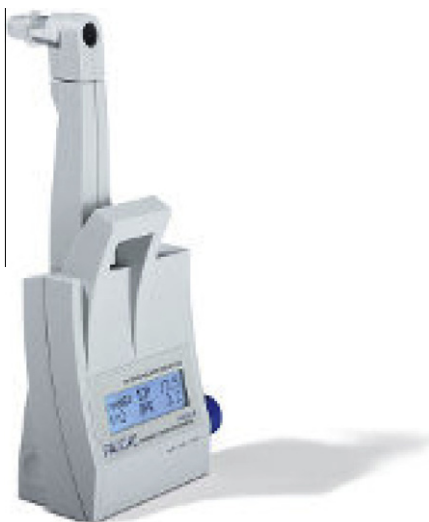
Figure 3 Pascal tonometry.

The measurement of intraocular pressure (IOP) after LASIK may not be accurate because of changes in central corneal thickness. Goldman applanation tonometry, the “gold standard” for IOP assessment, is based on the Imbert-Fick principle, it overestimates IOP for thick corneas, and underestimates IOP for thin corneas. The Ocular Hypertension Treatment Study (OHTS) showed central corneal thickness (CCT) to be