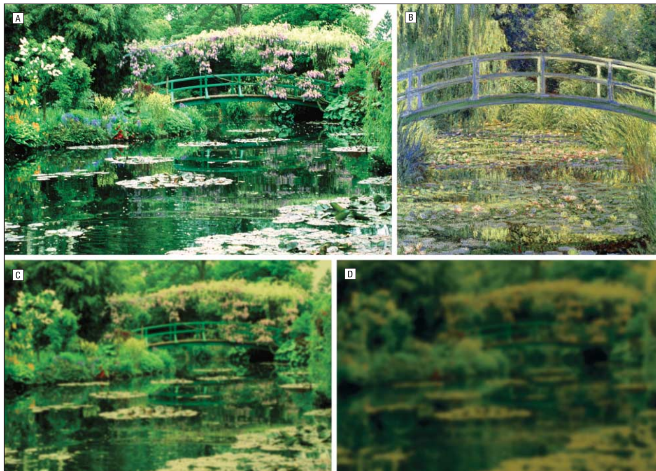
Figure 3. Monet's lily pond and the Japanese bridge at Giverny, France. A, Photograph of the bridge as it appears today (courtesy of photographer Elizabeth Murray). B, Monet's Water Lily Pond , a painting of the pond and bridge before any visual symptoms (1899; oil on canvas, 89 × 92 cm); National Gallery, London, England/Bridgeman Art Library. C, The same photograph of the bridge, blurred as it might appear through a moderate nuclear sclerotic cataract. D, The same photograph of the bridge as seen through a disabling cataract with a visual acuity of 20/200.

Degas' correspondence indicated that he was consciously trying to be more expressionistic or abstract; in fact, his pastels were drawn on larger and larger expanses of paper as he struggled to work. One critic wrote that "these sketches are the tragic witnesses of this battle of the artist against his infirmity." 14 One may reasonably ask whether Degas intended these images to appear to us the way they do and why he continued to work when the product seemed so out of line with his traditional style. Some answers may lie in the recognition of how these works appeared to him.