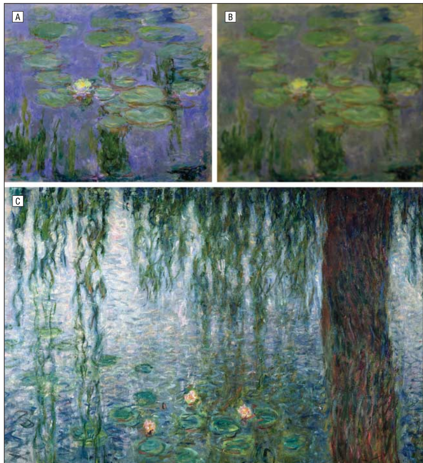
Figure 4. Water lily pond. A, Monet's painting Waterlilies done with moderate cataract (1915; oil on canvas, 130 × 153 cm); B, The same image blurred as it would have appeared to Monet through the cataract. C, Monet's painting Morning With Weeping Willows, detail of left section, done after the cataract was removed (1915-1926; oil on canvas, 200 × 425 cm)

I must digress at this point to note that artists can respond in several different ways to a yellow filter (cataract) in front of their world, and one cannot predict necessarily how it will influence their art. Because cataracts are chronic, a patient may not be aware that the world looks yellowish (as there are no normal colors with which to compare). However, whether an artist recognizes the yellow bias or not, there will be a choice between painting a yellowish world or adding extra blue as compensation (eg, to make the sky