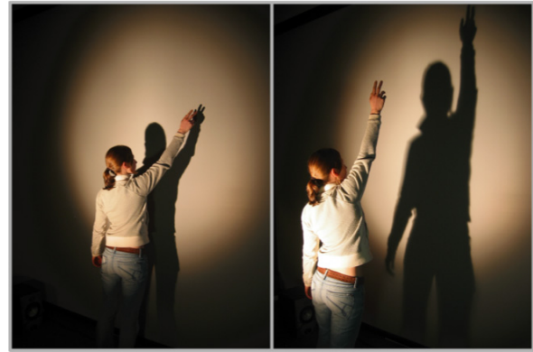
Figure 2 The user can control the reach of her shadow by moving closer to and farther away from the display.

Many techniques designed for distance interaction fail to achieve the goal of being interpretable. TractorBeam [9] provides a powerful means of pointing and interacting with remote information, but does not provide a clear link between the user's physical self and the data being acted upon. Proxy techniques such as Frisbee [7] or radar techniques such as Push-and-Pop [3] break down because the original data is isolated at a distance from the user and from the interaction. Throwing techniques [6] do not provide direct links to the initiating user, making it difficult to determine the originator of an action and thus the meaning of the interaction. As a result, these techniques impede collaborators, or even the user, from understanding and predicting the result of actions.