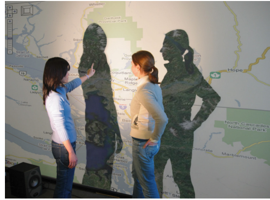
Figure 4 A mockup of how virtual shadows can be used as representation-altering Magic Shadows. In this case the shadows contain satellite photo data, while the surrounding regions hold conventional map data.

We developed a demonstration application using full body interaction via shadows with dynamic on-screen content. In this second prototype shadow sensing was accomplished using a light source behind the screen, captured with an infrared camera in front of the screen, and extracted by rudimentary computer vision techniques similar to what Tan and Pausch [13] used in a different context. A model of the user's location in space was then computed, and the shadows were rendered onto the screen. In contrast with the first prototype, where everything was “real” except for the computation of hand position, the second prototype's modeling and rendering were accomplished entirely in the vir-