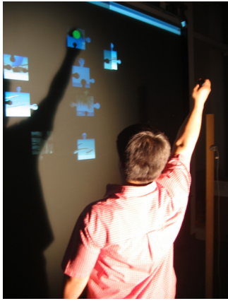
Figure 3 Using the Shadow Reaching prototype.