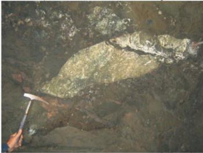
Fig. 3. : Fragment of marble within strongly altered basalt, suggesting mafic magma stoping. The photo was taken in the gallery, about 200 m underground. Around the fragments of marble, potassium metasomatism developed (the pale red part near the hammer). After Li (2012).