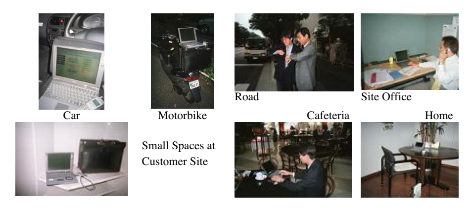
Figure 2. Various workplaces for mobile sales (photographs taken by sales representatives)

This investigation was conducted for about two weeks in 1999 by using the 'self-photo study' technique (Tamaru, et al., 2002; Hasuike, et al., 2003). In this study, each sales representative was provided with a disposable camera and was requested to photograph their workspace, tools, documents and coworkers during a typical work day (Figure 2). Interviews were conducted at a later date on the basis of the photographs, where the workers were questioned about the nature of their work, the use and applicability of the documents and technologies, etc. The subjects comprised three sales teams and nine sales representatives.