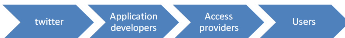
Figure 4: The twitter value chain

The following actors are involved in the twitter value chain: Twitter, application developers, access providers, and users (figure 4).