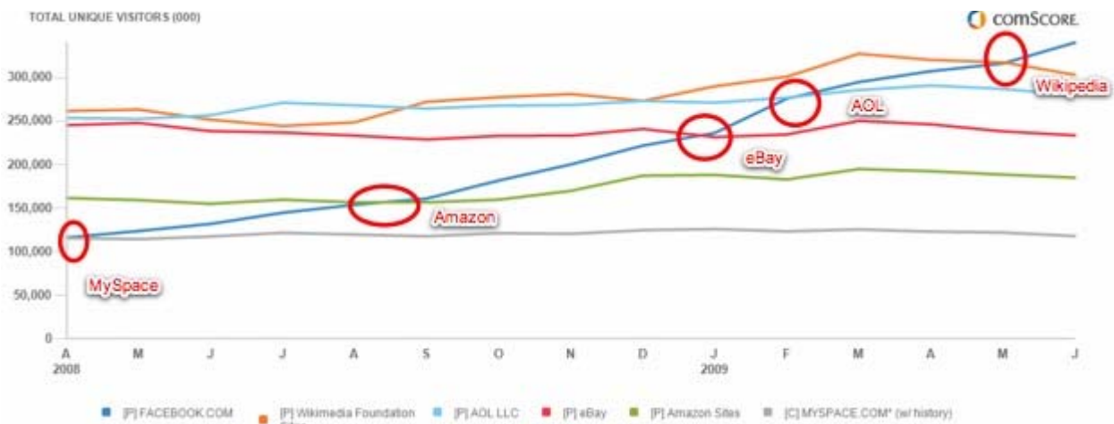
Figure 1: Facebook-users growth