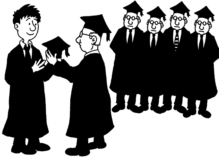
Fig. 1. “Congratulations, you are now capable of writing technical, impersonal and boring papers like myself and the other gentlemen – welcome to Academia”.

If an author really wants to make sure that the reader loses interest, I recommend that he/she does not introduce the ideas and main findings straightaway, but instead hide them at the end of a lengthy narrative. The technique can be refined by putting the same emphasis on what is unimportant or marginally important as on what is really important to make certain that the writing creates the proper hypnotic effect which will put the reader to sleep.