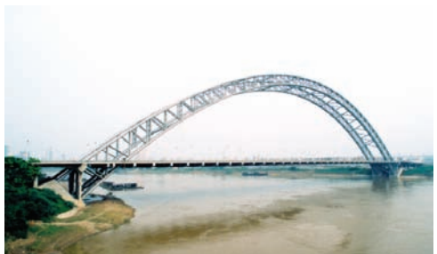
Figure 6: Nanning Yonghe Bridge