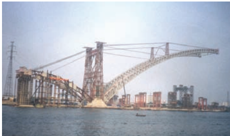
(a) A rotation unit after vertical swing