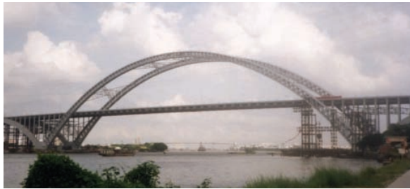
Figure 16: Yajisha Bridge in Guang-zhou