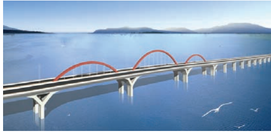
Figure 20: Image view of Wanbian Bridge in Fuzhou

selected based on the economic reason. For the three arches in the main bridge, it is not so much for strengthening for the continuous rigid frames as aesthetic advantages. This bridge is still under construction and will be completed at the end of 2008 (Chen 2007A).