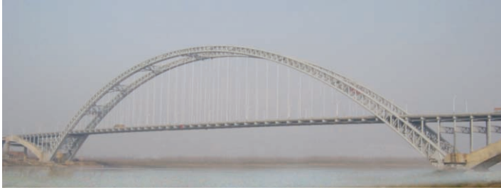
Figure 15: Maochaojie Bridge in Hunan

completed in 2000 (Figure 16). The former was erected by cantilever method, while the latter by combining vertical and horizontal swing method as shown in Figure 17 and 18.