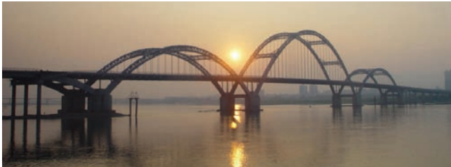
Figure 18: Ji-an Bailu Bridge in Jiangxi

Most of the fly-bird-type arch bridges are composed of three spans, however, there are some of them are composed of four spans or five spans. Ji-an Bailu Bridge (Figure 18) is one of the few five span fly-bird-type arch bridge. The arch ribs in the central three spans are triangular cross-section consisting of three CFST chords and were erected by cable stayed cantilever method, shown in Figure 19(Chen 2008).