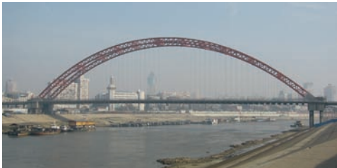
Figure 13: No.3 Hanjiang Bridge

Most of the CFST through rigid-frame tied arch has single span, while some of them have two or even more spans with separate tied bars for each span, such as Yanyan Yellow River Bridge in Lanzhou with three spans of 87 m +127 m +87m (Figure 14) (Chen 2008).