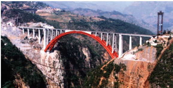
Figure 2: Baipanjiang Railway Bridge

All of the CFST arch bridges are highway bridges till Baipanjiang railway CFST arch bridge completed in Nov., 2001. The bridge is located in the Liupanshui District, Guizhou Province of the southwest of China. The gorge it crosses is very deep and the bridge is as high as 280m from the deck to the water level of the river. CFST arch bridge was selected as the main bridge after comparison of more than 10 bridge schemes. The main bridge is a deck CFST arch bridge with a main span of 236m (Figure 1). The arch ring is composed of two tilted ribs, connecting by lateral bracings. The steel tubular arch was erected by horizontal swing method, each rotation unit (including the arch rib, the rotation basement, etc.) is 104000kN in weigh, Figure 2 (Ma, T. L., Xu, Y., He, T., and Chen, K., 2001).