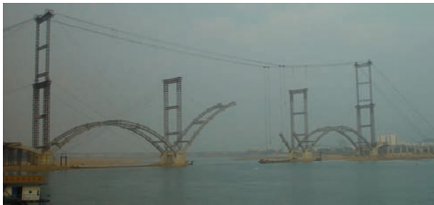
Figure 19: Erection of the arch ribs of Ji-an Bailu Bridge in Jiangxi