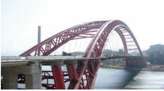
Figure 7: Huangshan Taipinghu Bridge