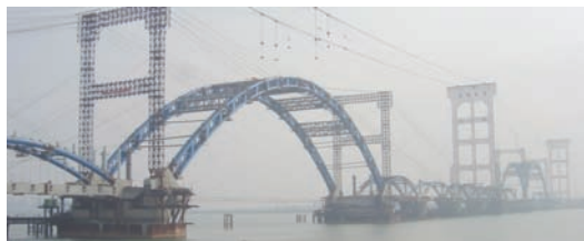
Figure 12: Cable Crane in Construction of Hang-zhou Qian-jiang No.4 Bridge