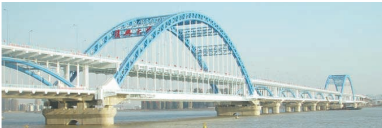
Figure 11: Hang-zhou Qian-jiang No.4 Bridge

Double-deck-bridge also appears in CFST arch bridge, e.g., the Qiangjiang No. 4 Bridge, with a span arrangement of 2 \times 85\text{m} + 190\text{m} + 5 \times 85\text{m} + 190\text{m} + 2 \times 85\text{m} , as shown in Figure 11. In the construction of this bridge, the steel arch ribs were erected before the stiffened girders and a large cable crane was employed as the main transportation method. The main structure of the cable crane is a three-tower and four-span cable structure, as shown in Figure 12. The span arrangement is (250 + 692.25 + 650.75 + 250)\text{m} . The central tower is 104m high and 48m wide and the each of the two side towers is 120m high and 42m wide (Chen, 2008).