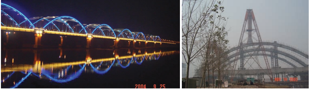
(a) Night view

shown in Figure 10a. In construction, two temporary bridges were constructed along the two sides of the bridge to be built. All the substructures and foundations were built of cast in situ reinforced concrete. A special gantry crane with lifting capacity of 600kN was designed and erected for the handling of the steel tubular rib segments and other precast PC or RC members, as shown in Figure 10b (Zhang et al. 2004).