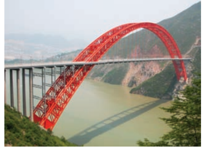
Figure 8: Wushan Yangtze River Bridge

The span of 460 m in Wushan Yangtze River Bridge is not only the span record in deck CFST arch bridge, but also the record of the longest CFST arch bridge in the world. The bridge completed in 2005 is a half-through concrete filled steel tubular arch bridge with a rise-span ratio of 1/3.8. The bridge width is 19m, in which 15.0m for traffic lane and 2 \times 1.5 m for walk side road as well as 2 \times 0.5 m for rails. There are two CFST truss arch ribs with a center to center distance of 19.7m. Each width of the rib is 4.14m and the height varies from 7.0m in crown to 14.0m in the spring. The steel tubular arch was erected by cantilever method with cable crane as the hoisting equipment, which is very suitable to the steep banks, as shown in Figure 9 (Mu et al, 2007).