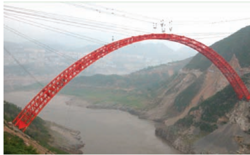
Figure 9: Erection of Steel Tubular Arch of Wushan Yangtze River Bridge

The span of 460 m in Wushan Yangtze River Bridge is not only the span record in deck CFST arch bridge, but also the record of the longest CFST arch bridge in the world. The bridge completed in 2005 is a half-through concrete filled steel tubular arch bridge with a rise-span ratio of 1/3.8. The bridge width is 19m, in which 15.0m for traffic lane and 2 \times 1.5 m for walk side road as well as 2 \times 0.5 m for rails. There are two CFST truss arch ribs with a center to center distance of 19.7m. Each width of the rib is 4.14m and the height varies from 7.0m in crown to 14.0m in the spring. The steel tubular arch was erected by cantilever method with cable crane as the hoisting equipment, which is very suitable to the steep banks, as shown in Figure 9 (Mu et al, 2007).