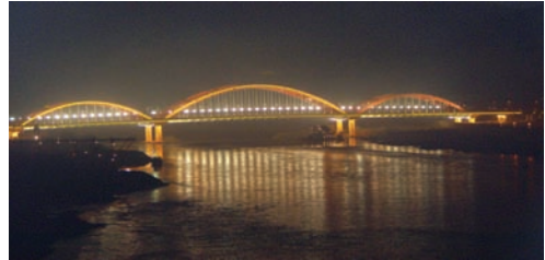
Figure 14: Yanyan Yellow River Bridge