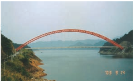
Figure 5: Chunan Napu Bridge

Half-through bridge is a good choice when the rise of the arch bridges is much higher than the road elevation for the long span. Half-through (true) arch bridges are counted for 62 (47%) in the investigated 131 CFST arch bridges with a span no smaller than 100m (Chen, 2007). Moreover, it can reduce the height of the spandrel columns. Many long-span CFST half-through true arch bridges have been built. This type bridge can also have large spanning capacity. There are four of such bridges with spans longer than 300m have been built, they are Chunan Napu Bridge in Zhe-jian with a main span of 308m, Nanning Yonghe Bridge in Guangxi with a main span of 335.4m, Huangshan Taipinghu Bridge in Anhui with a main span of 336m and Wushan Yangtze River Bridge in Chongqing with a main span of 460m (Figures. 5 to 8) (Chen, 2008).