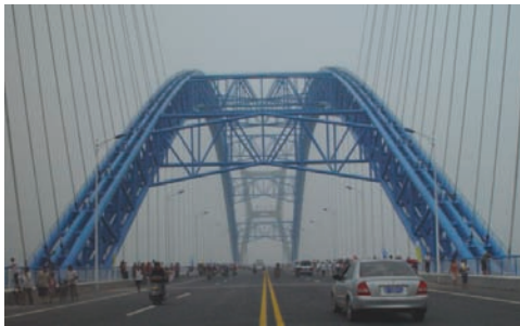
(a) Completed photo

The main span of Lianxiang Bridge in Hunan is a cable-stayed CFST arch bridge (Figure 21a) (Chen 2008). Its span arrangement is 120m+400m+120m. The domain structure is a three-span fly-bird-type arch, in which the central span is a CFST truss arch and the two sides are cantilever concrete half arches. Two towers stand on the main piers to carry cables to stay the central CFST arch ribs and the side span decks. The side spans were constructed by cast in-situ. The steel tubular arch ribs in central span were erected by cantilever cable-stayed method with cable crane. Two temporary steel structures stand on the top of the cable stayed tower to serve as the tower of the cable crane, as shown in Figure 21b.