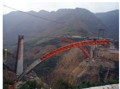
Figure 3: Horizontal Swing

An investigation on CFST arch bridges in China shows that only about 8% of CFST arch bridges are deck bridges, while it account for 86% in concrete arch bridges (47% for box