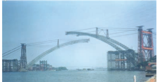
(b) Horizontal swing