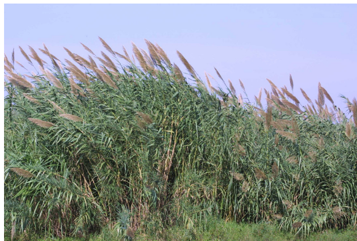
Figure 2. Giant reed with flower heads

Giant reed is often established vegetatively, utilizing rhizome or stem pieces from locally grown biotypes; this is because there are few, if any, commercially available cultivars in the United States and also giant reed seed is not viable. Commercial production of plantlets through micro-propagation of embryogenic callus has also become available. Large rhizomes with well-developed buds can be transplanted directly into furrows 8–10 inches deep in the early spring after the threat of frost. Mature stem cuttings or whole stems with two or more nodes can also be planted 4–6 inches deep. Row spacings of 36- to 40-inch centers, with a final population of 4,000–8,000 initial plants/A is