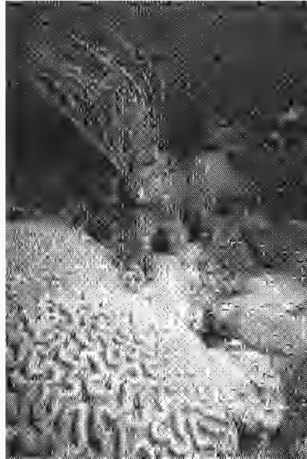
Along with rainforests, coral reefs represent the second pinnacle of biodiversity on Earth.

There currently are about 1.8 million described species in all environments on Earth, although various authors have estimated that 5-120 million species