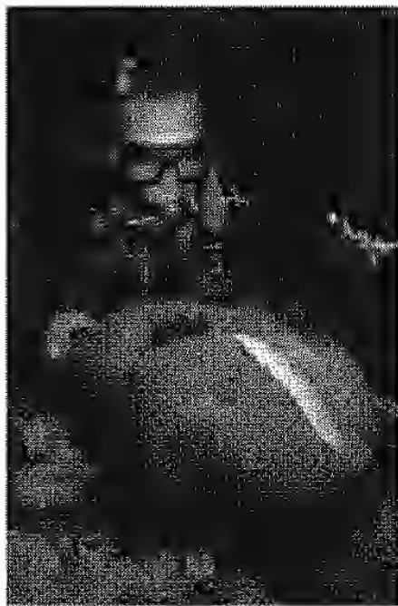
Coral with black band disease.

cies are small (e.g., 10-50 mm) on coral reefs and most small species have relatively small geographic ranges, poorly sampled areas (e.g., some areas of the Indo-West Pacific) are very likely to contain undocumented species with endemic distributions that do not extend into better sampled areas.