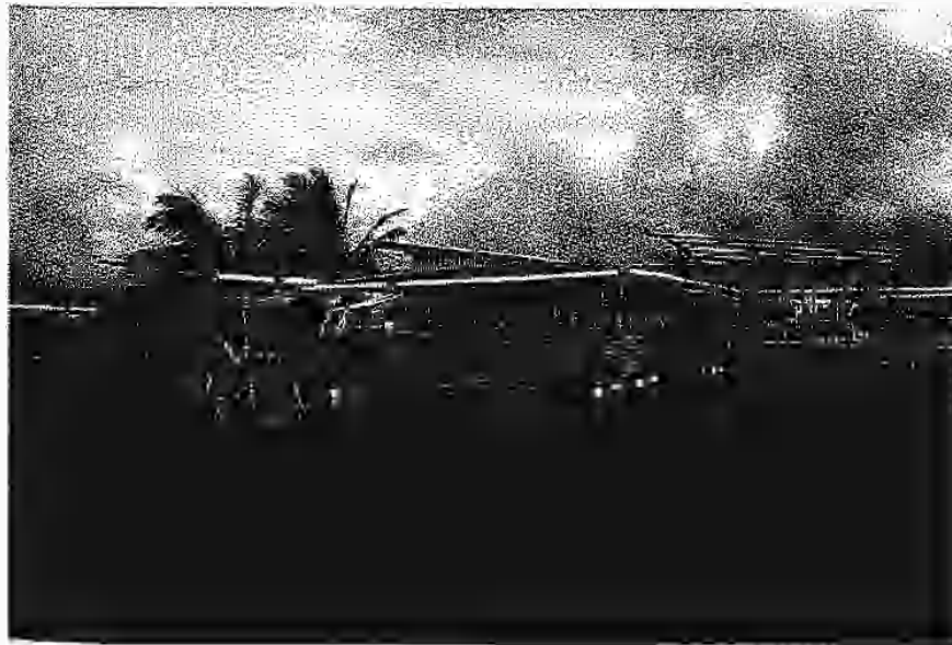
The Smithsonian Tropical Research Institute marine station in the San Blas Islands, Panama.

As recently as 1992, researchers discovered in the marine plankton a major new archaeobacterial group in which genetic relationships to their nearest rela-