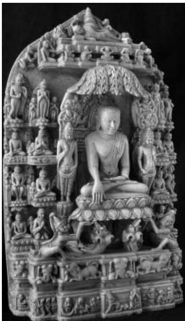
Fig. 1 The Enlightenment, surrounded by further scenes of the Buddha's life, including the 'Great Events' and the 'Stations', 20.2 x 12.2 x 4.7 cm

more carved in the typical dark-grey, almost black stone of Bihar/Bengal, have been discovered in a wide area spread over North India, Sri Lanka, Tibet and Burma. Due to the fact that a group of fairly well preserved examples was initially collected at Pagan, it has generally been assumed that these sculptures must have been produced in Burma, more particularly at Pagan – whereas examples recovered in India or Sri Lanka remained isolated in the context of their finding and whereas the images observed in Tibetan monasteries were clearly 'imported' from countries located south of the