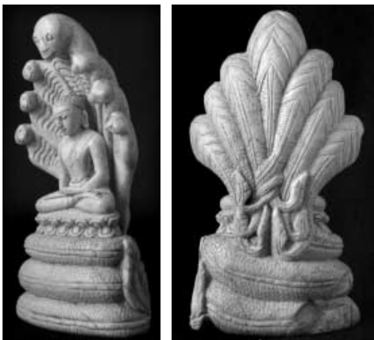
Fig. 4a-b The Buddha seated below Mucilinda, total size: 9 x 4.7 cm

North Thailand. 15) These inscriptions can be incised in a frame clearly shaped or drawn on the un-carved surface of the lotus pedestal: as a matter of fact, in the seven images of the seated Buddha which are carved in the round, the lotus-seat is not represented all around, but a plain space of varying width is reserved in the central part of the lotus in the back of the image, probably