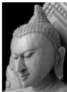
Fig. 9 Detail of a standing Buddha 'walking', 15.4 cm x 5 cm