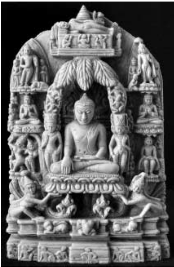
Fig. 19 The 'Eight Great Events', 11.2 x 7.1 cm. See also Fig. 6