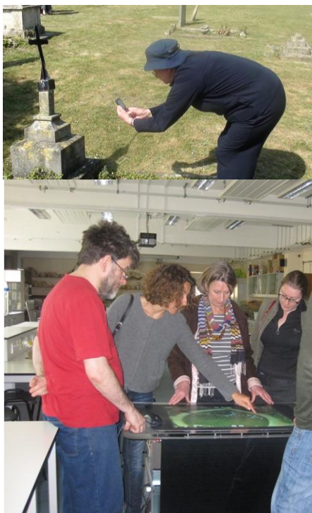
Figure 1: Capturing Location-Based Information and reflecting on it at Mill Road

locations to which information such as parish and war grave records, inscriptions, photos, stories and interpretations could be linked. This information could be added and reviewed whilst mobile through tablet computers and smartphones, and also in a nearby room equipped with a tabletop computer and laptops for further research, discussion and reflection.