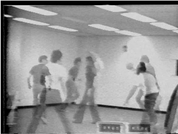
Figure 1. A single frame captured from a late-generation video of the umbrella-woman sequence used by Neisser and colleagues (eg Neisser 1979). The woman is in the center of the image and her umbrella is white.

In subsequent studies of selective looking, Neisser and his colleagues used this 'basketball-game' task [see Neisser (1979) for a description of several different versions]. In the most famous demonstration, observers attend to one team of players, pressing a key whenever one of them makes a pass, while ignoring the actions of the other team. After about 30 s, a woman carrying an open umbrella walks across the screen (this video was also superimposed on the others so all three events were partially transparent; see figure 1). She is visible for approximately 4 s before walking off the far end of the screen. The games then continue for another 25 s before the tape is stopped. Of twenty-eight naive observers, only six reported the presence of the umbrella woman, even when questioned directly after the task (Neisser and Dube, cited in Neisser 1979). Interestingly, when subjects had practice performing the task on two similar trials before the trial with the unexpected umbrella woman, 48% noticed her. When subjects just watched the screen and did not perform any task, they always noticed the umbrella woman, a result consistent with the inattentional-blindness findings reviewed earlier (and with work on saccade-contingent changes; see Grimes 1996; McConkie and Zola 1979).