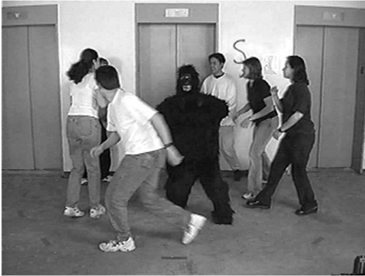
Figure 3. A single frame from an additional experimental condition in which the gorilla stopped in the middle of the display, turned to face the camera, thumped its chest, and then continued walking across the field of view. Subjects performed the Easy monitoring task while attending to the White team, and the noticing rate was similar to that in the corresponding condition with the standard (shorter) Opaque/Gorilla event.

Twelve new observers (6) watched this video while attending to the White team and engaging in the Easy monitoring task; only 50% noticed the event. This is roughly the same as the percentage that noticed the normal Opaque/Gorilla-walking event (42%) under the same task conditions.