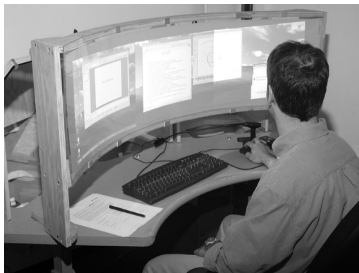
Figure 1. User working on experimental Dsharp display.

We next present a user study aimed at understanding if there are indeed productivity benefits to using very large displays. It is our hypothesis that there must be an advantage to having additional screen real estate—both a cognitive load advantage as well as a reduction in the need to perform window management. If there are indeed measurable benefits, this study will provide the HCI community with the contribution of revealing the magnitude of the effect, and that these benefits can emerge during daily office computing task contexts. We close with some thoughts about what novel software user interface solutions might enhance very large multimonitor display user interaction.