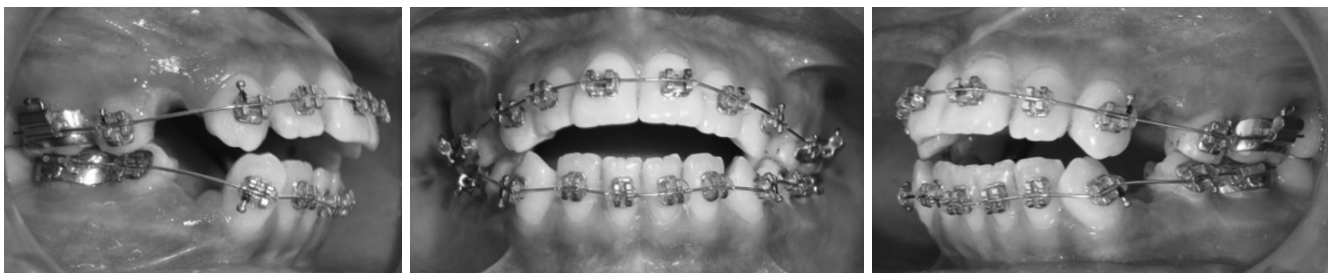
Figure 2: Treatment procedure with extraction of first premolars and bonding of brackets