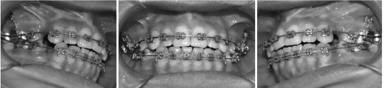
Figure 4: Banding of upper second pre-molars and intrusion of upper posterior segment