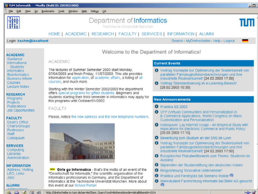
Fig. 1 Homepage of the Department of Informatics of TUM with Drehscheibe functionality

The service grew and we soon extended the focus to building a “platform for information exchange and matchmaking” in the department – a community support platform. We identified different target groups. These were students, alumni, faculty and external (future students, external researchers, companies). Regarding the target groups we decided to focus on supporting information exchange, communication and awareness (matchmaking) for students and alumni while providing a very flexible medium that might also support other fields. This task was accomplished in several steps. The system was restructured, was re-implemented and was linked to several other systems and resources. During the development the solution was adapted by other departments and universities and in this turn extended with various possibilities for configuration. In the following subsection we will briefly describe the core functionality of the system as it is in operation today.