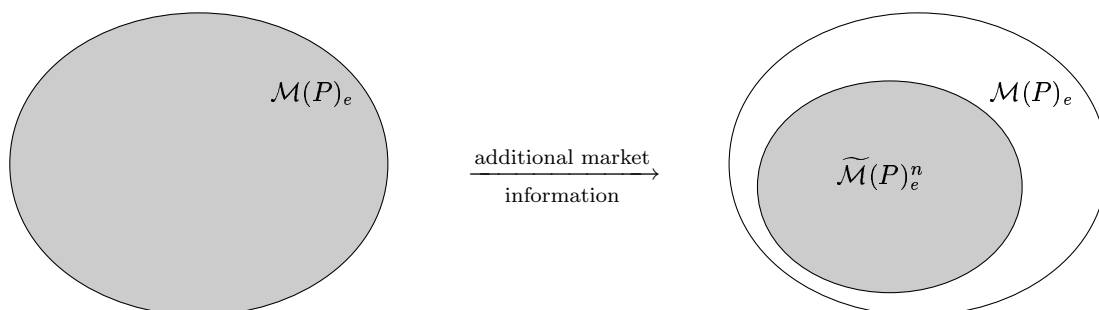
Figure 1: Observing the prices \{C_0^1, \dots, C_0^n\} restricts the set of possible equivalent martingale measures.

The definition of the admissible equivalent martingale measure and assumption 2 imply that